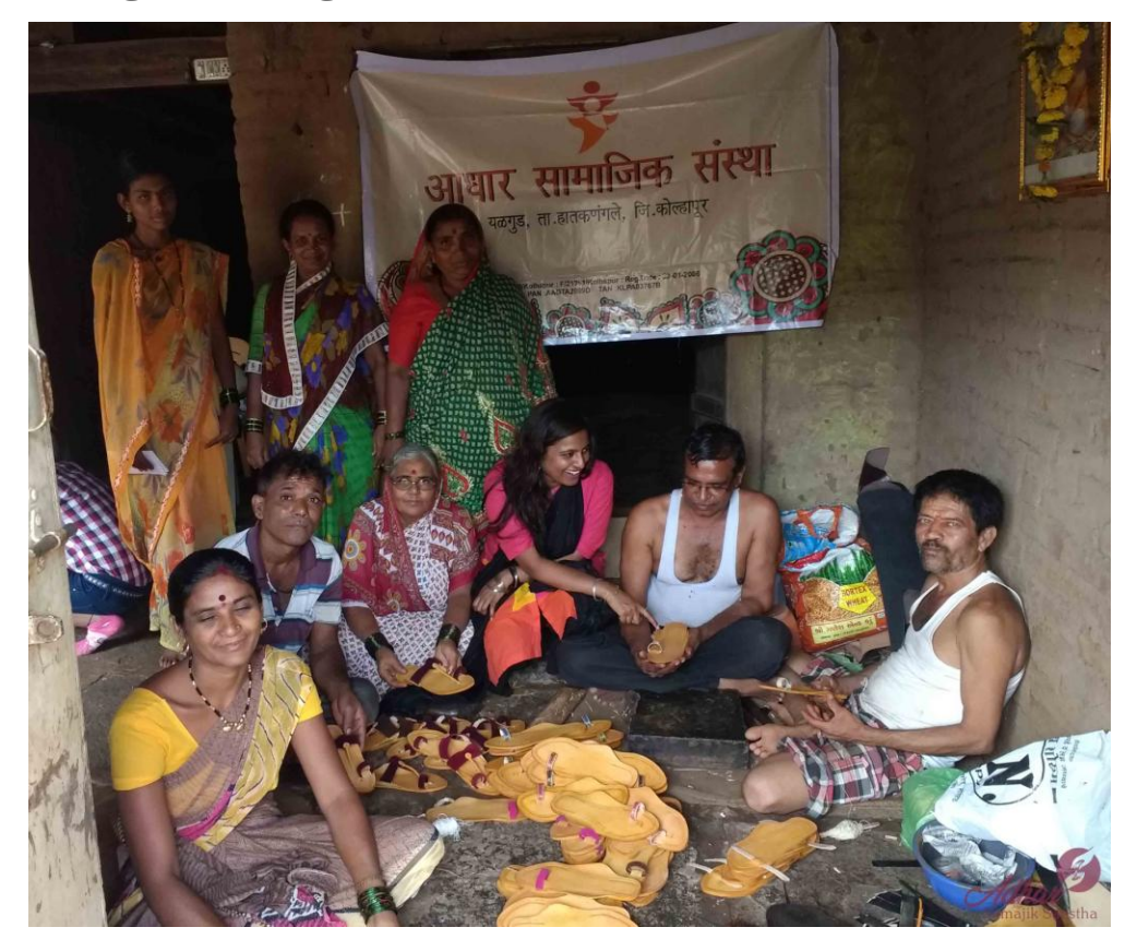
Design Development and Technical Workshop organised for artisans at Sangrul

Baskets training workshop for the needy artisans at Arag- Bedag