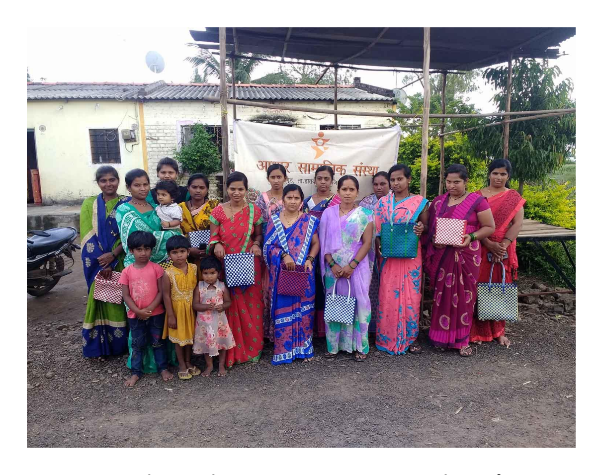
We give wings to Women Artisan's Dreams and Aspirations!