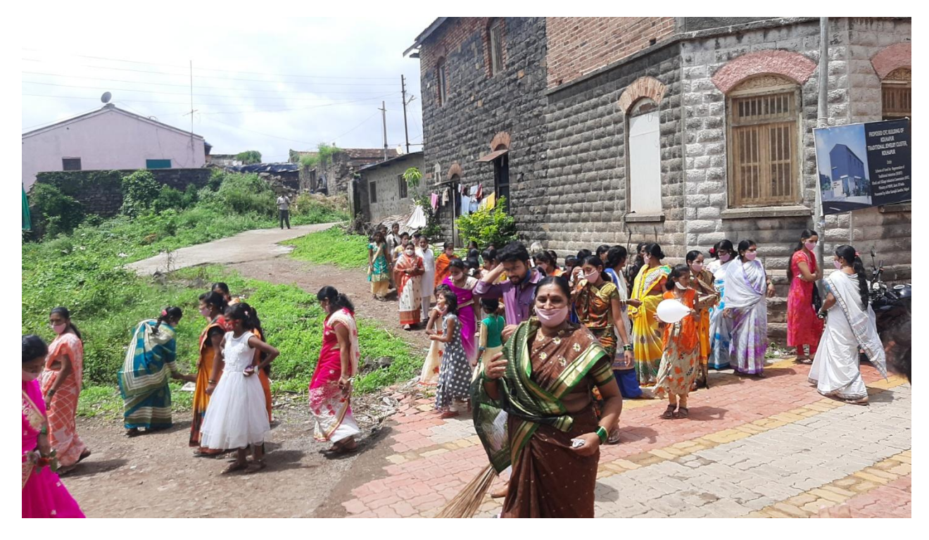
Swacha Bharat Abhiyaan organized at Yalgud