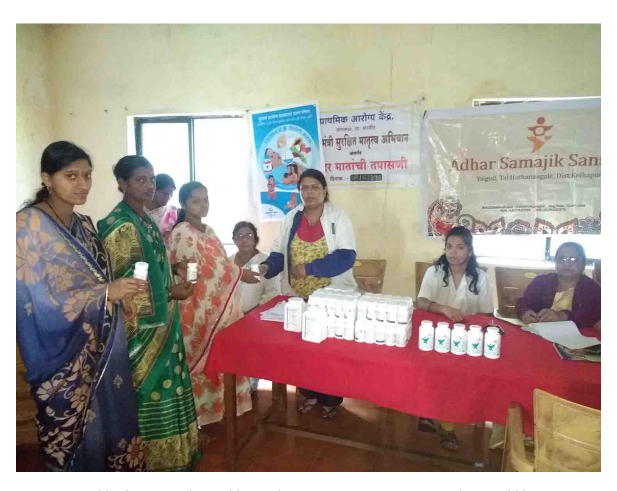
Medicine Distribution to womens in Villages