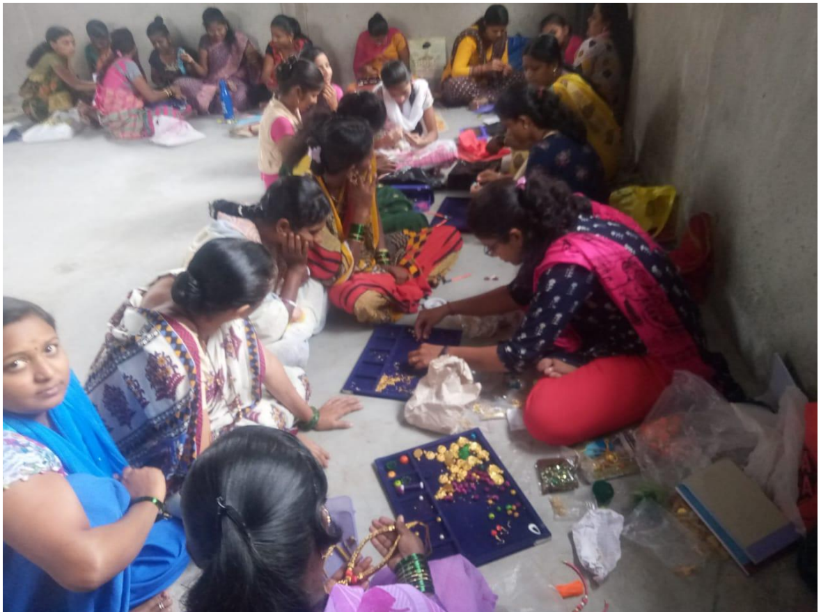
Jewellery training workshop was organized for women artisans in Yalgud.