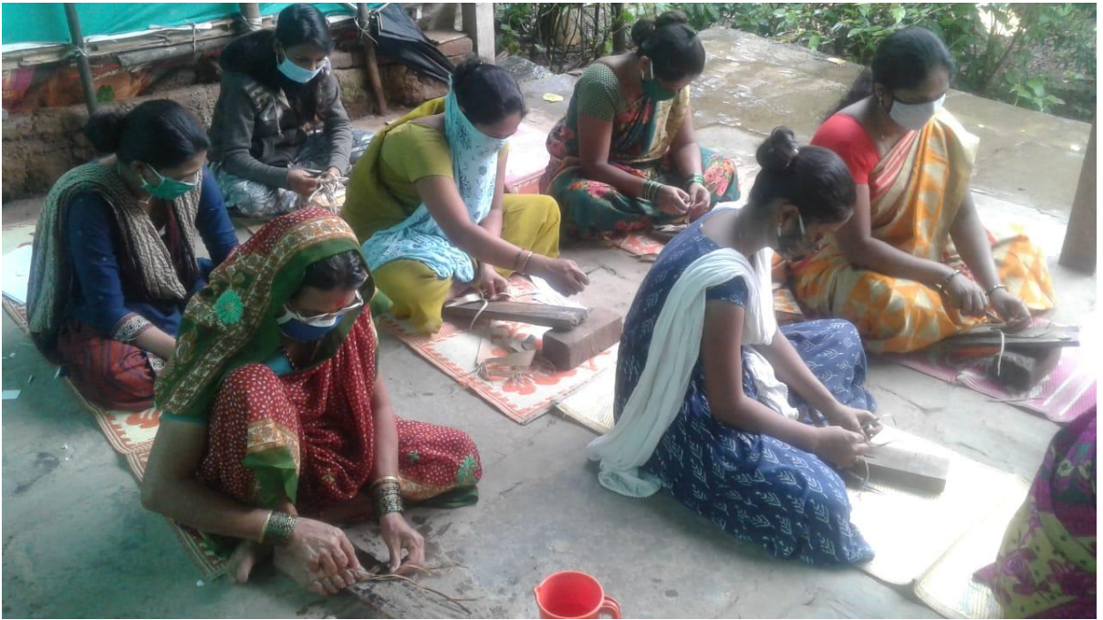
Kolhapuri Chappals artisans who are identified, trained, motivated and their skills are enhanced. Workshop at Sawarde..