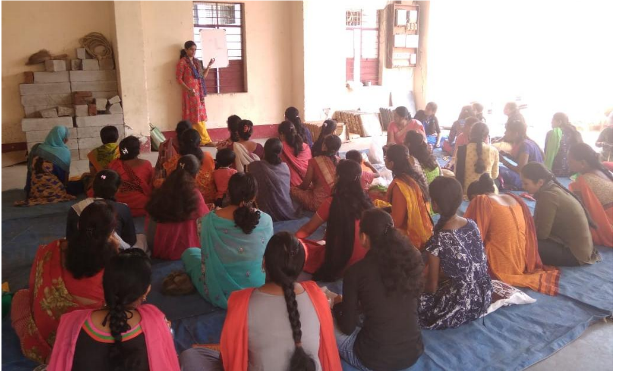
Jewellery Design workshop was organized for women artisans in Hupari.