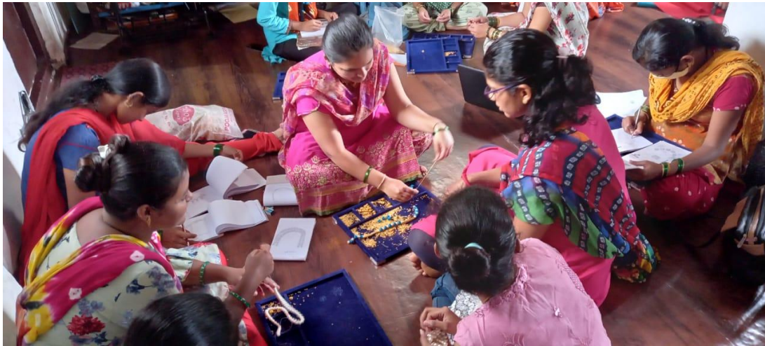
Jewellery training workshop was organized for women artisans in Temblaiwadi.