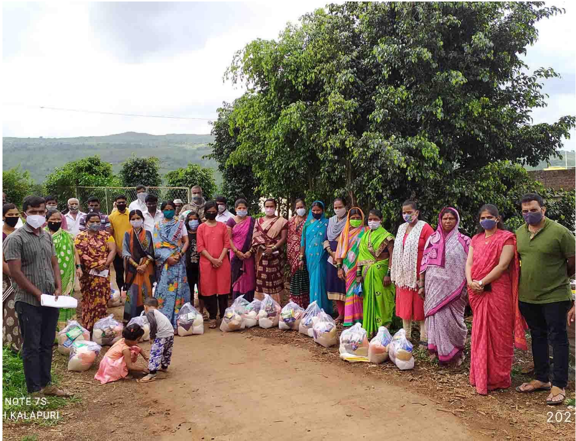
Grocery Kits in Covid times