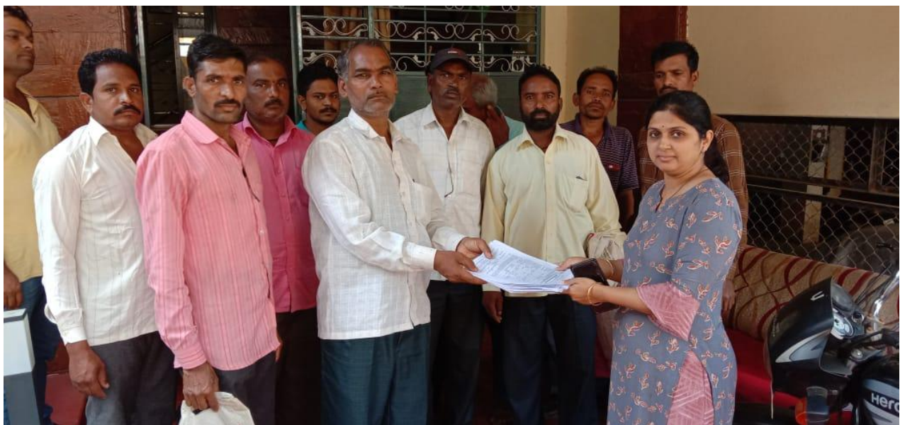
Helping needy artisans to get MUDRA Loan Schemes.