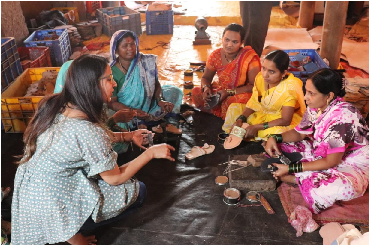
Leather Design Workshop was organised for Chappals artisans in Kanchanwadi.