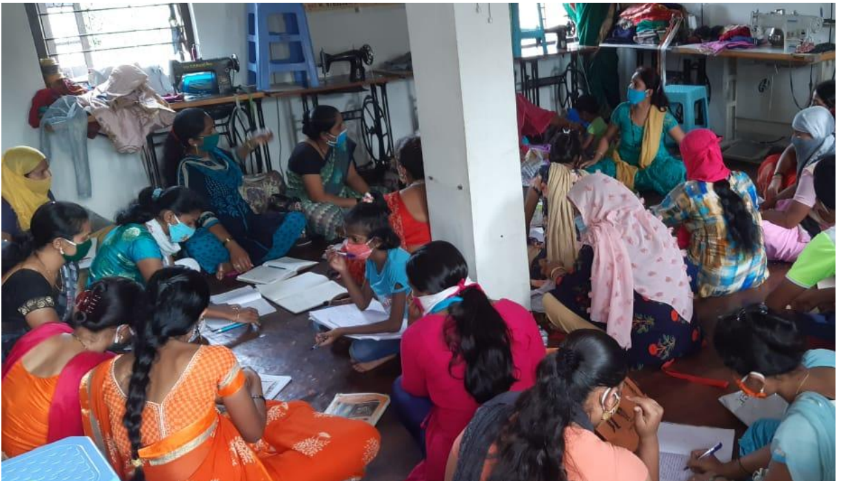
Women artisans in Uchgaon were trained for jute bag making.