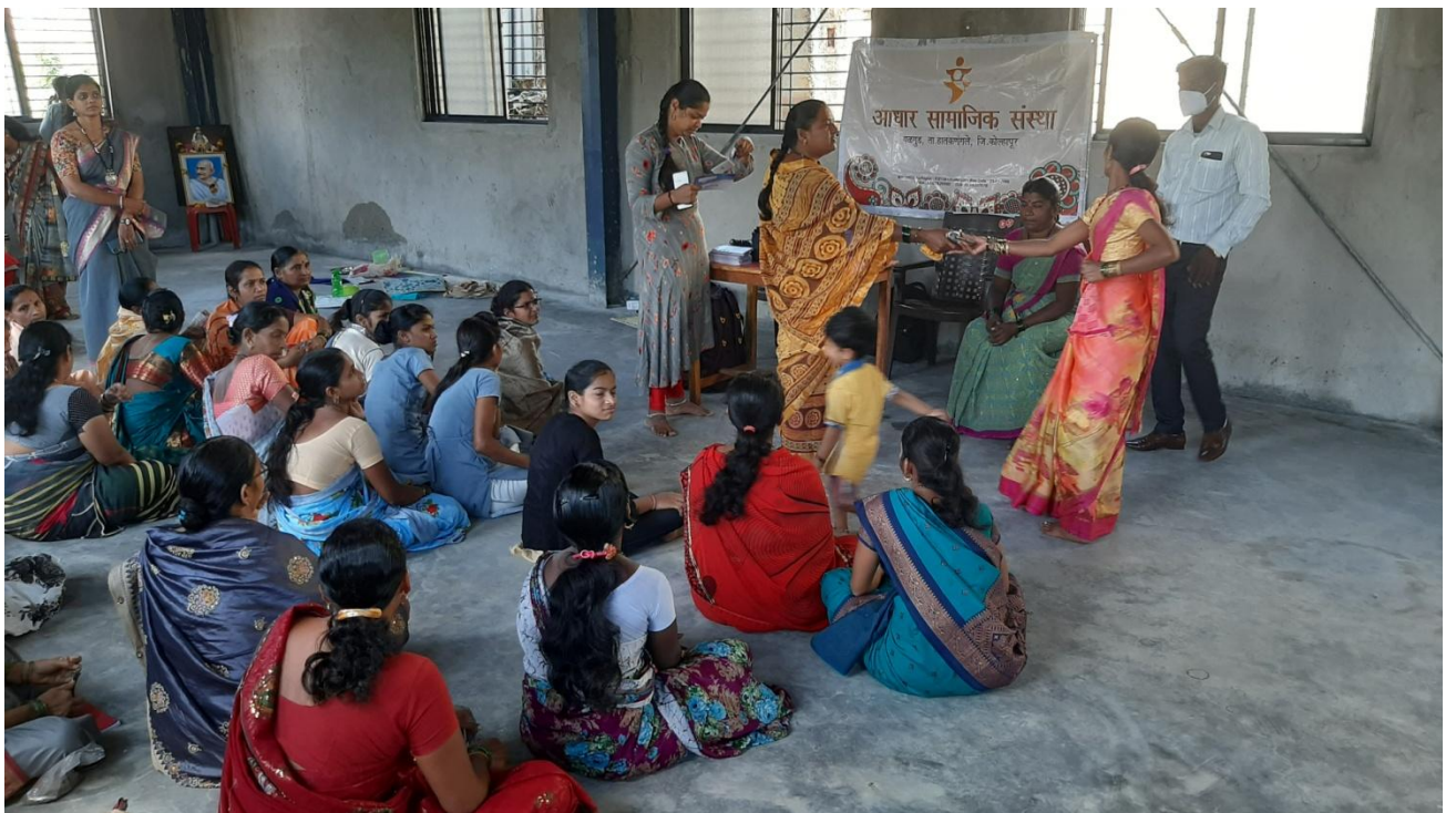
Health Camp for the women artisans in Yalgud.